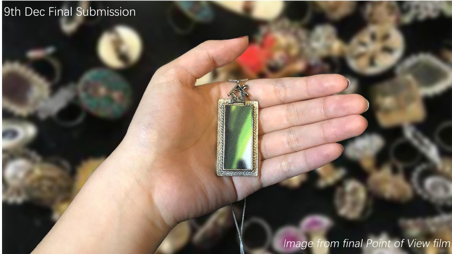
Image from final Point of View film